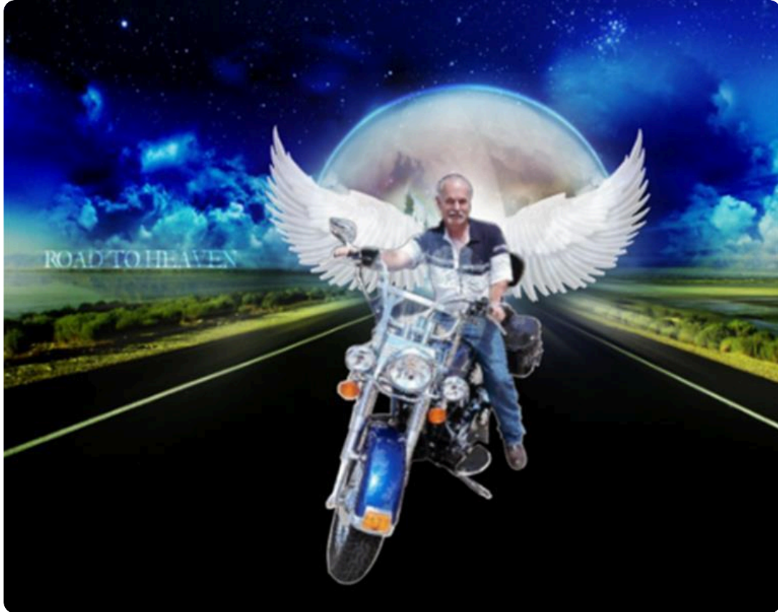
RIDING WITH THE ANGELS